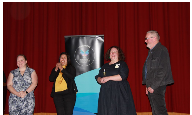
Pitch Up event

Supported by event partners The Funding Network, dozens of community members raised their hands in support of the project which “pitched” proposals for support to the audience.