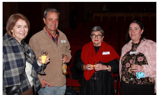
Pitch Up event supporters