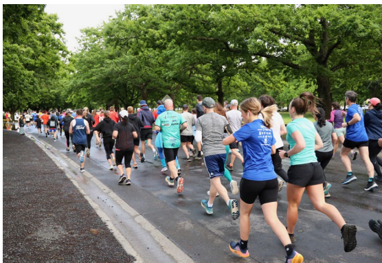
And they're off the start of the 10km race

The event is the largest community fun run in the Ballarat area and was once again sponsored by Federation University.