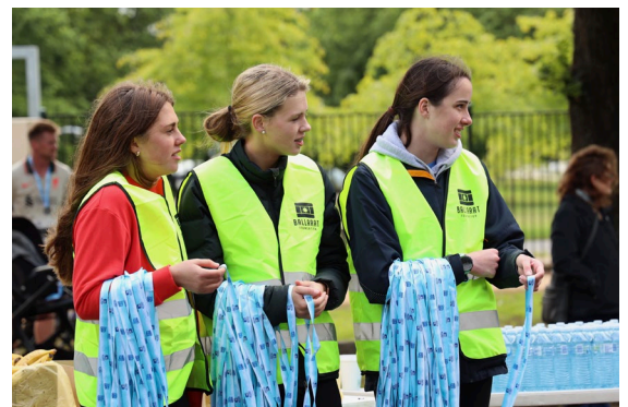
Volunteers at Run for a Cause

The Volunteer Coordinators Network, chaired by Ballarat Foundation, has continued to grow, and now has over 50 members from diverse backgrounds such as volunteering, health, disability, emergency services, aged care, education, and local government. The purpose of this group is to actively promote volunteering across the region through events, training and sharing information and industry updates.