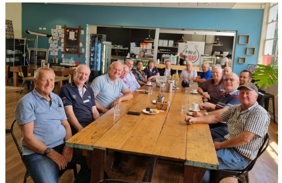
L2P Volunteers enjoy a social catch up

engaging in volunteering. Each group has more than 15 members from a variety of backgrounds and industries who used this platform to share information and best practice ideas. 2023 will see each group undertake a major project to alleviate some of these barriers.