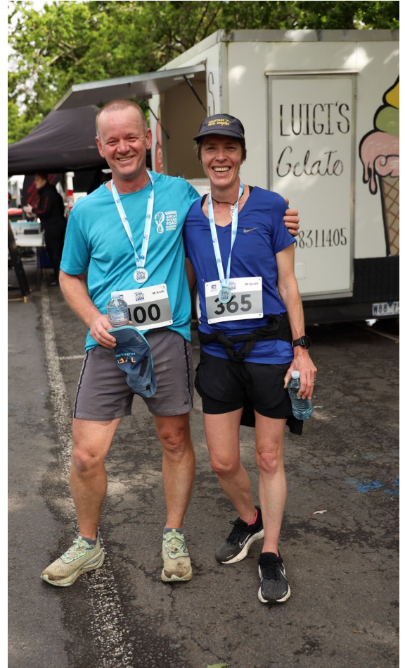
Run for a Cause participants